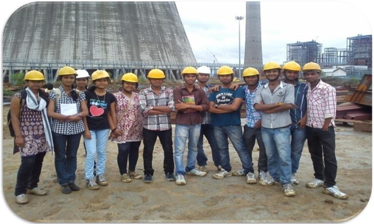
Event 39. Photos One day Industrial Workshop at “CST Power Station, Chandrapur” on 15/03/2019